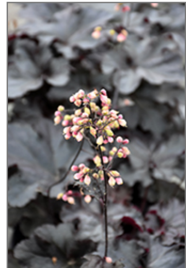
Black Pearl Coral Bells flowers