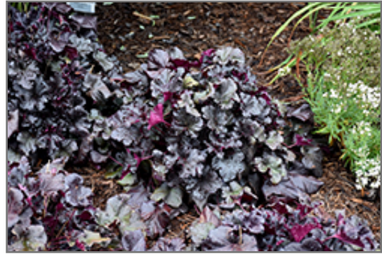
Black Pearl Coral Bells

Black Pearl Coral Bells will grow to be about 10 inches tall at maturity extending to 20 inches tall with the flowers, with a spread of 26 inches. When grown in masses or used as a bedding plant, individual plants should be spaced approximately 20 inches apart. Its foliage tends to remain low and dense right to the ground. It grows at a medium rate, and under ideal conditions can be expected to live for approximately 10 years. As an evergreen perennial, this plant will typically keep its form and foliage year-round.