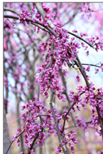
Pink Heartbreaker Redbud flowers

Pink Heartbreaker Redbud is recommended for the following landscape applications;