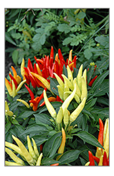
Chilly Chili Ornamental Pepper fruit

When grown indoors, Chilly Chili Ornamental Pepper can be expected to grow to be about 16 inches tall at maturity, with a spread of 18 inches. It grows at a medium rate, and under ideal conditions can be expected to live for approximately 1 years. This houseplant requires direct sun for optimal performance, and should therefore be situated in a room that gets bright sunlight for a good part of the day; it is not a good choice for rooms lit only by artificial light. It is very adaptable to both dry and moist soil, but will not tolerate any standing water. The surface of the soil shouldn't be allowed to dry out completely, and so you should expect to water this plant once and possibly even twice each week. Be aware that your particular watering schedule may vary depending on its location in the room, the pot size, plant size and other conditions; if in doubt, ask one of our experts in the store for advice. It is not particular as to soil type or pH; an average potting soil should work just fine.