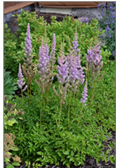
Dwarf Chinese Astilbe in bloom