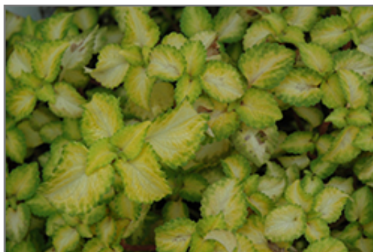
Terra Nova Electric Slide Coleus foliage