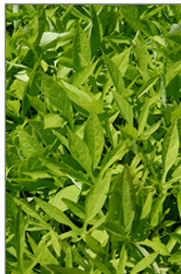
SolarPower Lime Sweet Potato Vine foliage