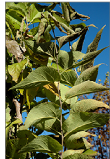
Prairie Sentinel Hackberry foliage