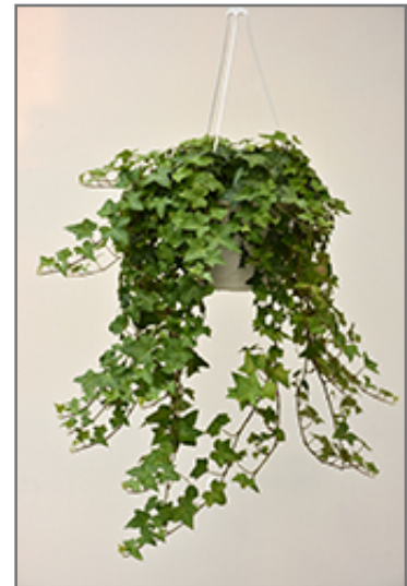
English Ivy