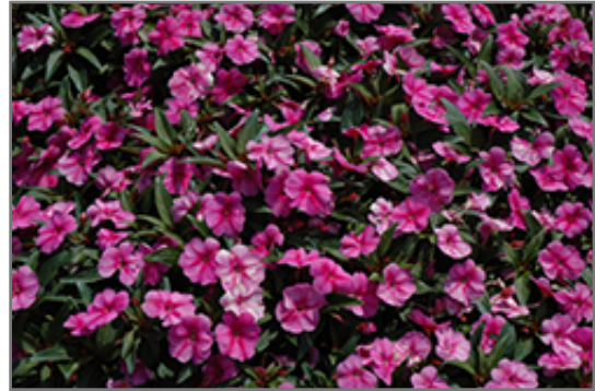
Bounce Pink Flame Impatiens flowers