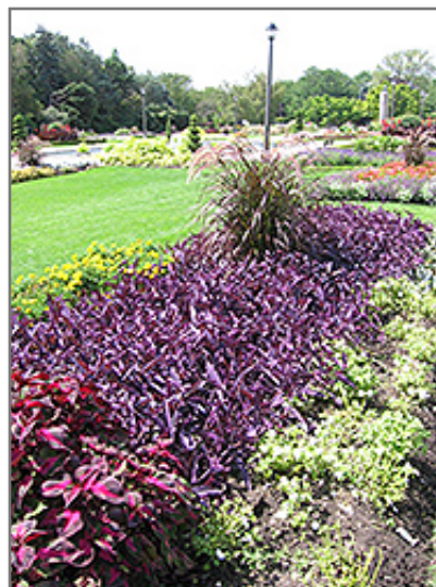
Purple Heart Spider Lily

Purple Heart Spider Lily is recommended for the following landscape applications;