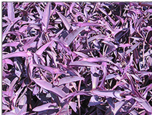
Purple Heart Spider Lily foliage