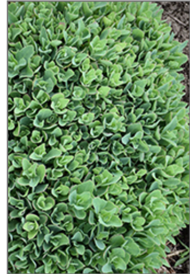
Carl Stonecrop foliage

Carl Stonecrop will grow to be about 16 inches tall at maturity, with a spread of 24 inches. When grown in masses or used as a bedding plant, individual plants should be spaced approximately 18 inches apart. Its foliage tends to remain dense right to the ground, not requiring facer plants in front. It grows at a fast rate, and under ideal conditions can be expected to live for approximately 15 years. As an herbaceous perennial, this plant will usually die back to the crown each winter, and will regrow from the base each spring. Be careful not to disturb the crown in late winter when it may not be readily seen!