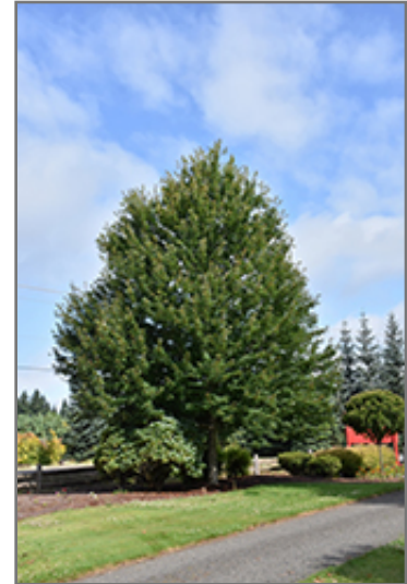
Redpointe Red Maple