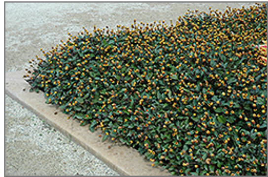
Peek A Boo Para Cress in bloom