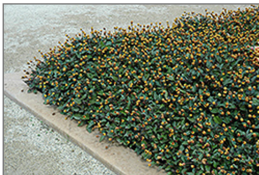
Peek A Boo Para Cress in bloom