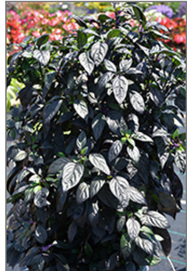
Black Pearl Ornamental Pepper