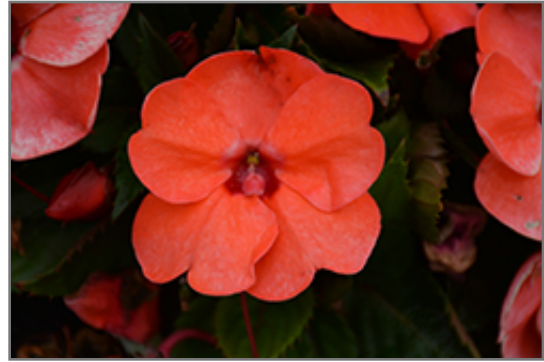
SunPatens Compact Hot Coral New Guinea Impatiens flowers

This plant will require occasional maintenance and upkeep, and should not require much pruning, except when necessary, such as to remove dieback. It is a good choice for attracting bees and butterflies to your yard. It has no significant negative characteristics.