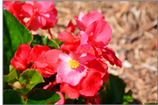
Whopper Rose Green Leaf Begonia flowers

This is a high maintenance plant that will require regular care and upkeep, and usually looks its best without pruning, although it will tolerate pruning. Deer don't particularly care for this plant and will usually leave it alone in favor of tastier treats. Gardeners should be aware of the following characteristic(s) that may warrant special consideration;