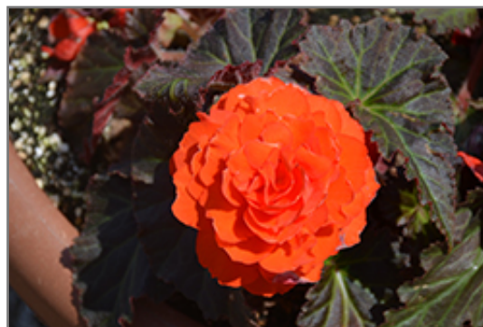
Nonstop Mocca Deep Orange Begonia flowers

Nonstop Mocca Deep Orange Begonia is recommended for the following landscape applications;