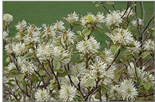
Dwarf Fothergilla flowers

Dwarf Fothergilla will grow to be about 3 feet tall at maturity, with a spread of 3 feet. It tends to fill out right to the ground and therefore doesn't necessarily require facer plants in front. It grows at a slow rate, and under ideal conditions can be expected to live for 40 years or more.