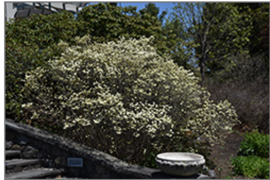
Dwarf Fothergilla in bloom

Dwarf Fothergilla is recommended for the following landscape applications;