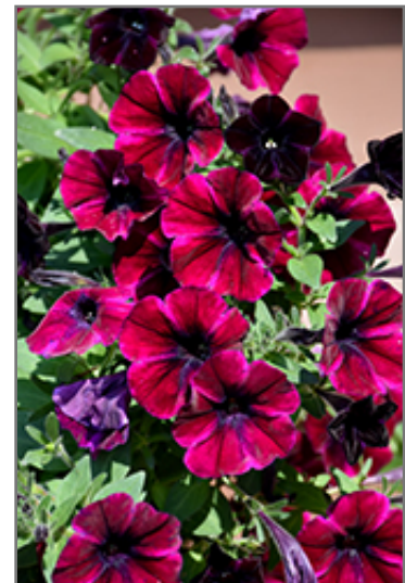
Sweetunia Johnny Flame Petunia flowers