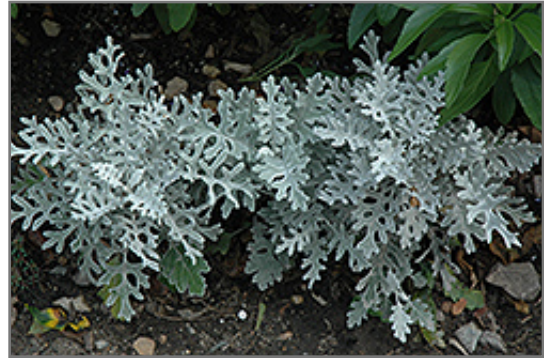
Silver Dust Dusty Miller foliage