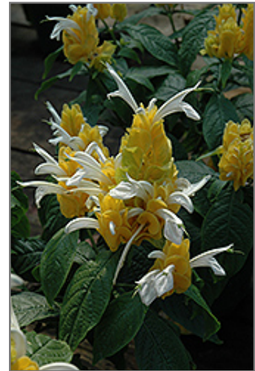
Golden Shrimp Plant flowers