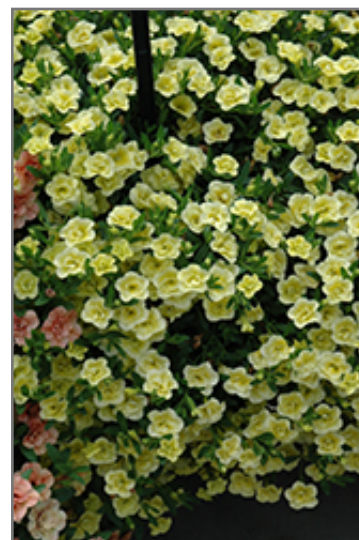
MiniFamous Double Lemon Calibrachoa flowers