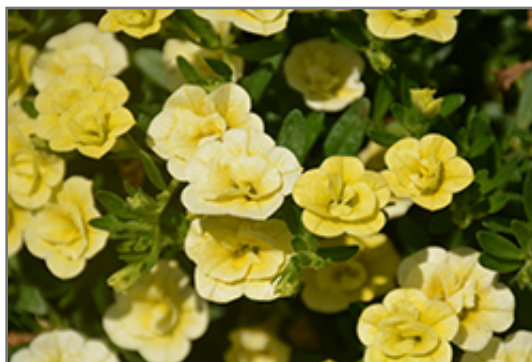
MiniFamous Double Lemon Calibrachoa flowers

This plant will require occasional maintenance and upkeep. Trim off the flower heads after they fade and die to encourage more blooms late into the season. It is a good choice for attracting bees and hummingbirds to your yard, but is not particularly attractive to deer who tend to leave it alone in favor of tastier treats. It has no significant negative characteristics.