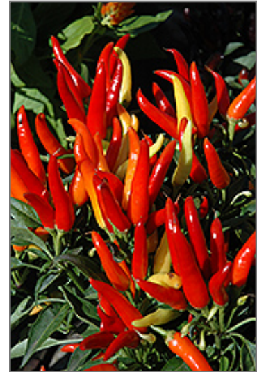
Chilly Chili Ornamental Pepper fruit

Chilly Chili Ornamental Pepper is recommended for the following landscape applications;