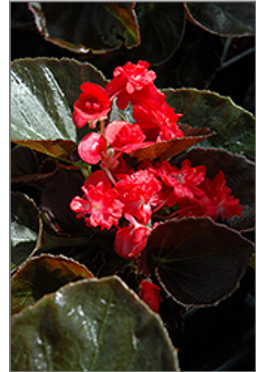
Doublet Red Begonia flowers