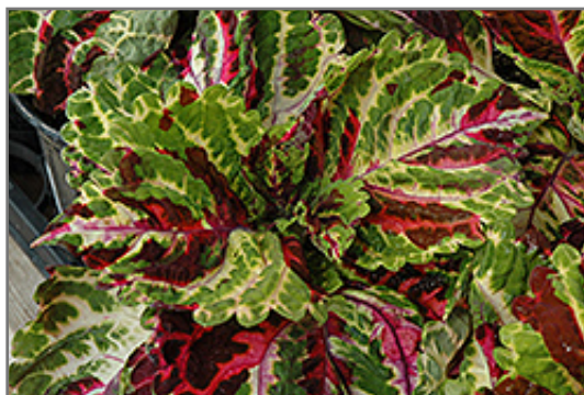
Kong Mosaic Coleus foliage