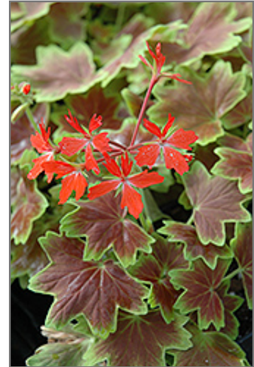
Vancouver Centennial Geranium flowers