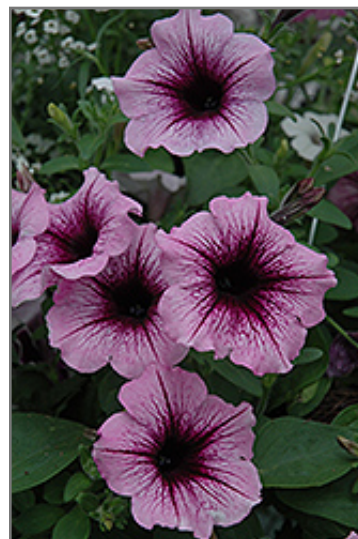
Supertunia Bordeaux Petunia flowers