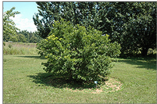
Jade Butterflies Ginkgo