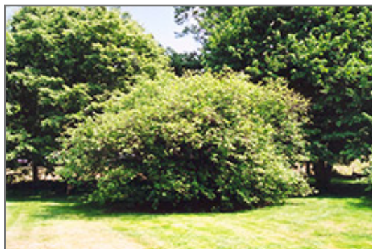
American Hazelnut

American Hazelnut will grow to be about 12 feet tall at maturity, with a spread of 12 feet. It tends to be a little leggy, with a typical clearance of 2 feet from the ground, and is suitable for planting under power lines. It grows at a medium rate, and under ideal conditions can be expected to live for approximately 30 years. While it is considered to be somewhat self-pollinating, it tends to set heavier quantities of fruit with a different variety of the same species growing nearby.