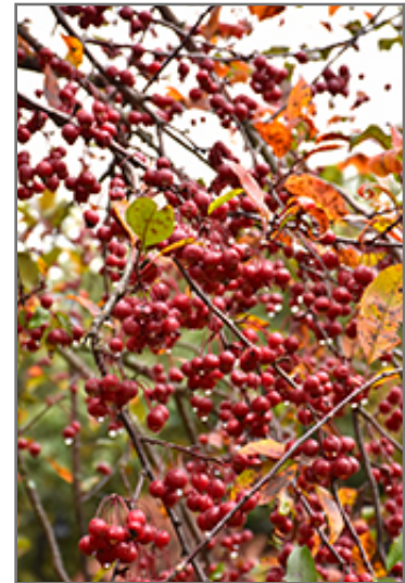
Prairiefire Flowering Crab fruit

Our Growing Place Choice plants are chosen because they are strong performers year after year, staying attractive with less maintenance when planted in the right place.