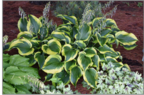
Atlantis Hosta

Atlantis Hosta is recommended for the following landscape applications;