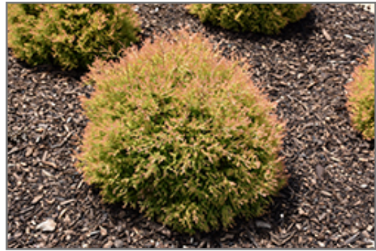
Fire Chief Arborvitae

Fire Chief Arborvitae is recommended for the following landscape applications;