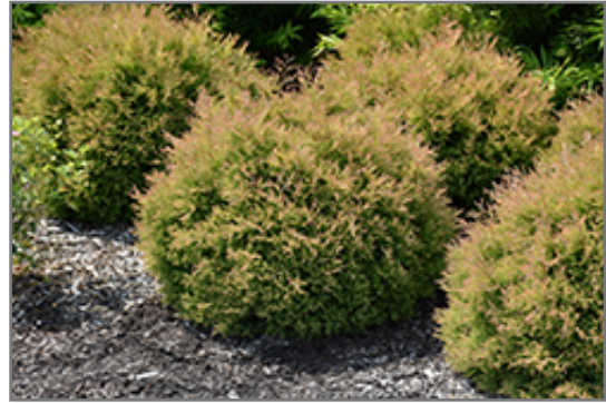
Fire Chief Arborvitae

Our Growing Place Choice plants are chosen because they are strong performers year after year, staying attractive with less maintenance when planted in the right place.