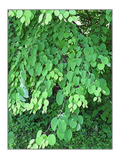
Katsura Tree foliage