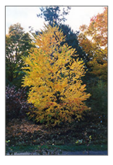
Katsura Tree in fall

This tree should only be grown in full sunlight. It prefers to grow in average to moist conditions, and shouldn't be allowed to dry out. It is particular about its soil conditions, with a strong preference for rich, acidic soils. It is somewhat tolerant of urban pollution, and will benefit from being planted in a relatively sheltered location. This species is not originally from North America.