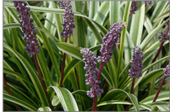
Variegata Lily Turf flowers

Variegata Lily Turf is recommended for the following landscape applications;