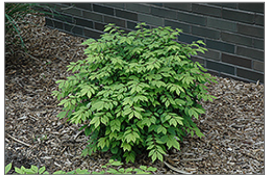
Little Moses Burning Bush