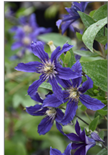
Sapphire Indigo Clematis flowers