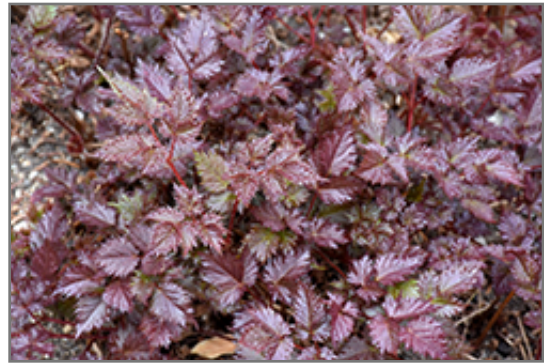
Delft Lace Astilbe foliage

Delft Lace Astilbe will grow to be about 16 inches tall at maturity extending to 24 inches tall with the flowers, with a spread of 12 inches. When grown in masses or used as a bedding plant, individual plants should be spaced approximately 12 inches apart. Its foliage tends to remain dense right to the ground, not requiring facer plants in front. It grows at a medium rate, and under ideal conditions can be expected to live for approximately 10 years. As an herbaceous perennial, this plant will usually die back to the crown each winter, and will regrow from the base each spring. Be careful not to disturb the crown in late winter when it may not be readily seen!