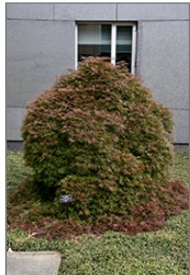
Orangeola Cutleaf Japanese Maple