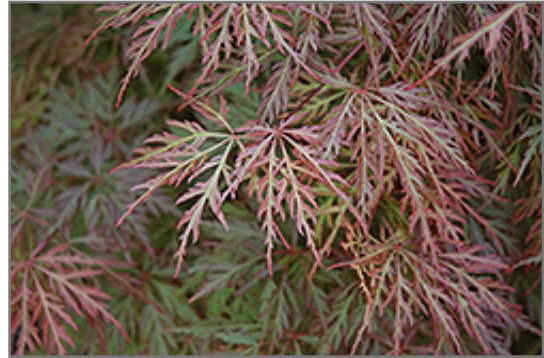
Orangeola Cutleaf Japanese Maple foliage

Orangeola Cutleaf Japanese Maple will grow to be about 8 feet tall at maturity, with a spread of 8 feet. It tends to be a little leggy, with a typical clearance of 2 feet from the ground, and is suitable for planting under power lines. It grows at a slow rate, and under ideal conditions can be expected to live for 60 years or more.