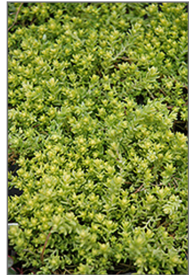
Golden Moss Stonecrop foliage