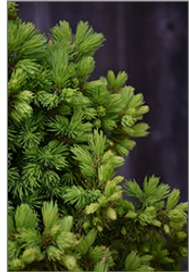
Rainbow's End Spruce foliage

Our Growing Place Choice plants are chosen because they are strong performers year after year, staying attractive with less maintenance when planted in the right place.