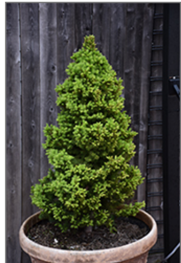
Rainbow's End Spruce