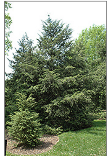
Canadian Hemlock