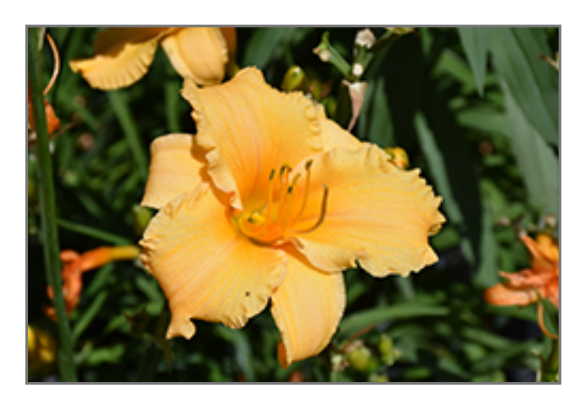
Happy Ever Appster Apricot Sparkles Daylily flowers