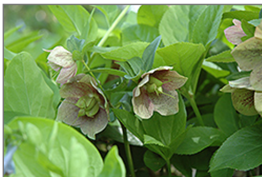
Oriental Hellebore flowers