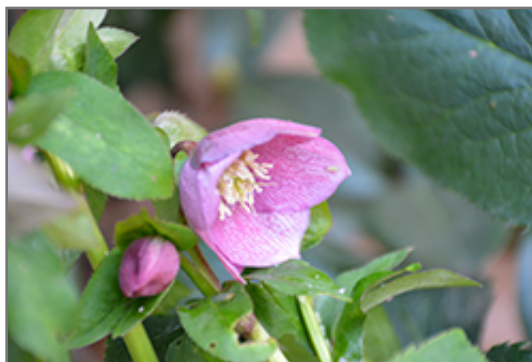
Oriental Hellebore flowers

Oriental Hellebore is recommended for the following landscape applications;