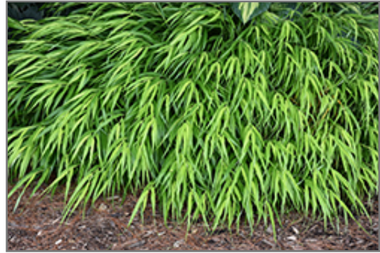
All Gold Hakone Grass foliage