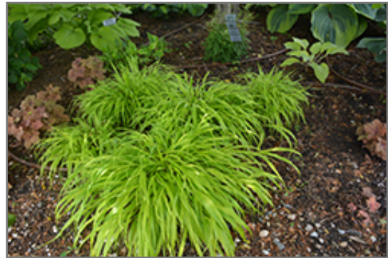
All Gold Hakone Grass