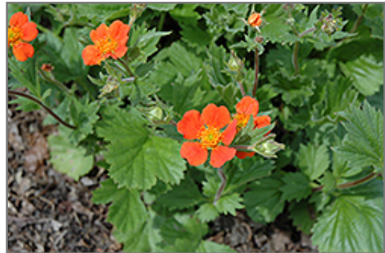
Boris Avens flowers

Boris Avens is recommended for the following landscape applications;