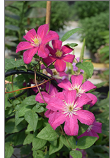
Barbara Harrington Clematis flowers