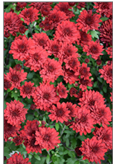
Five Alarm Red Chrysanthemum flowers