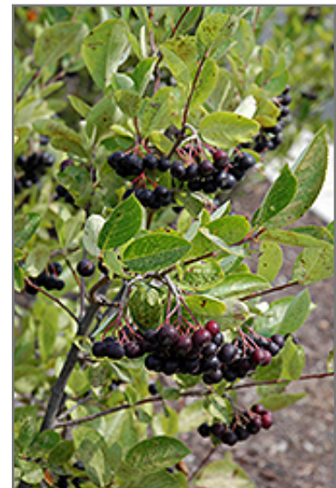
Iroquois Beauty Black Chokeberry fruit