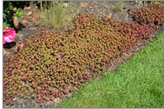
Fulda Glow Stonecrop