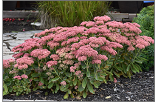
Autumn Fire Stonecrop in bloom

Autumn Fire Stonecrop is recommended for the following landscape applications;